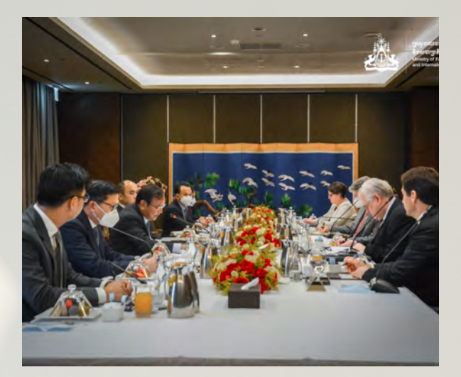
COVID- Contracting of ASE for Myanmar