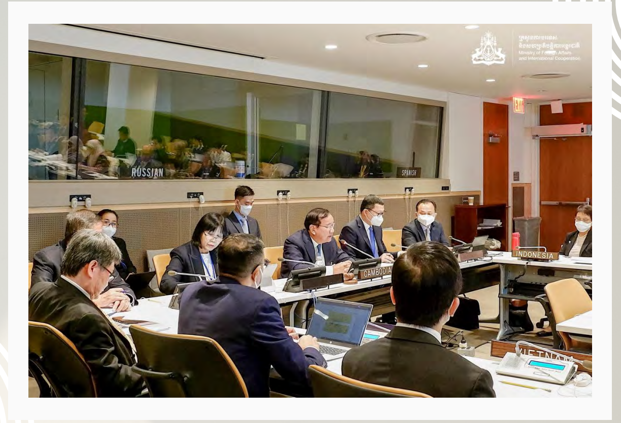
Informal ASEAN Foreign Ministers' Meeting (IAMM) 22 September 2022, New York, U.S.A